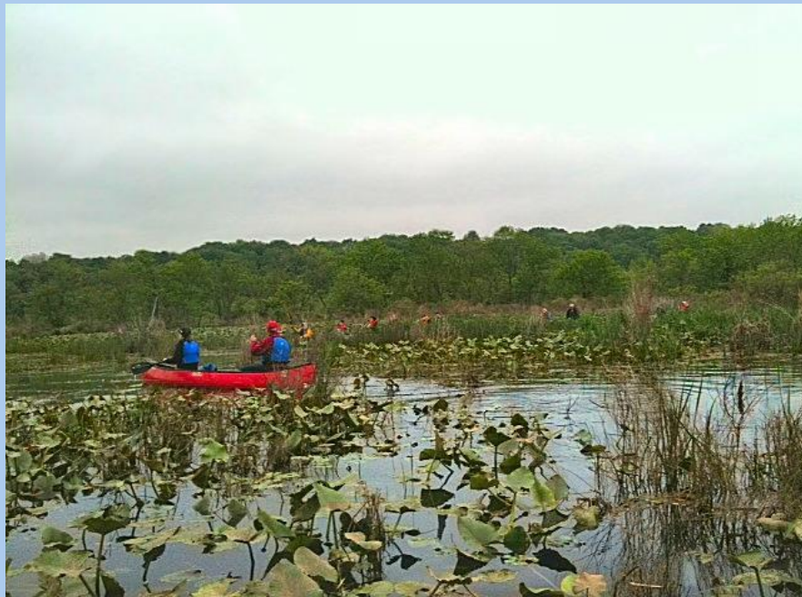
Paddling the Spatterdock Marsh, May 2011